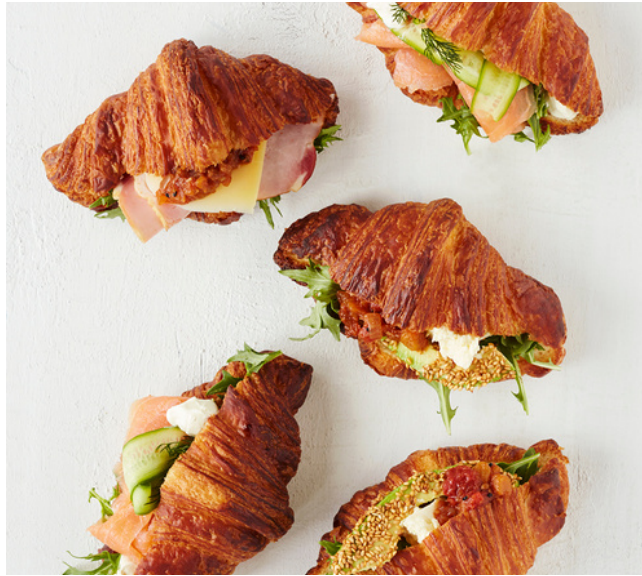
BRUNCH FILLED CROISSANT