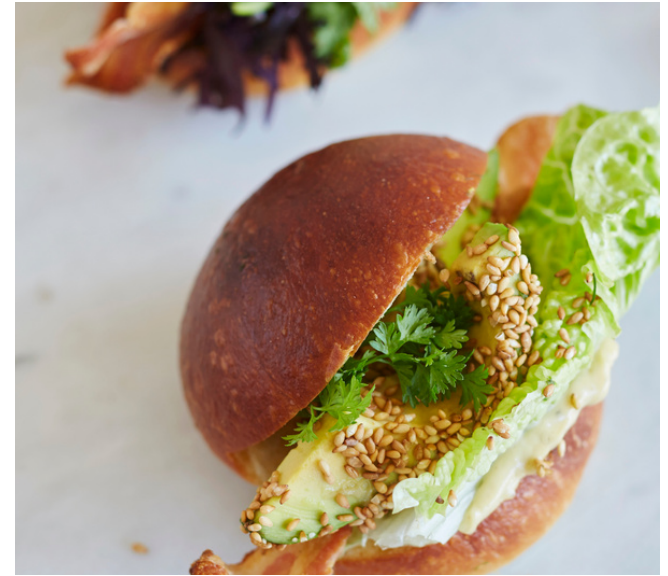
BRUNCH BRIOCHE ROLL